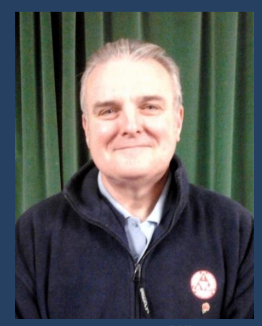
By Andrew Griffiths

As you read this, England will be in a 4-week lockdown. Consequently, IAM RoadSmart has suspended all driver and rider training again for the duration of the lockdown - "Lockdown 2.0" as it is called (beyond me why it is not just Lockdown 2. Maybe there could be micro Lockdowns 2.1, 2.2, 2.3 etc. already in the planning!).