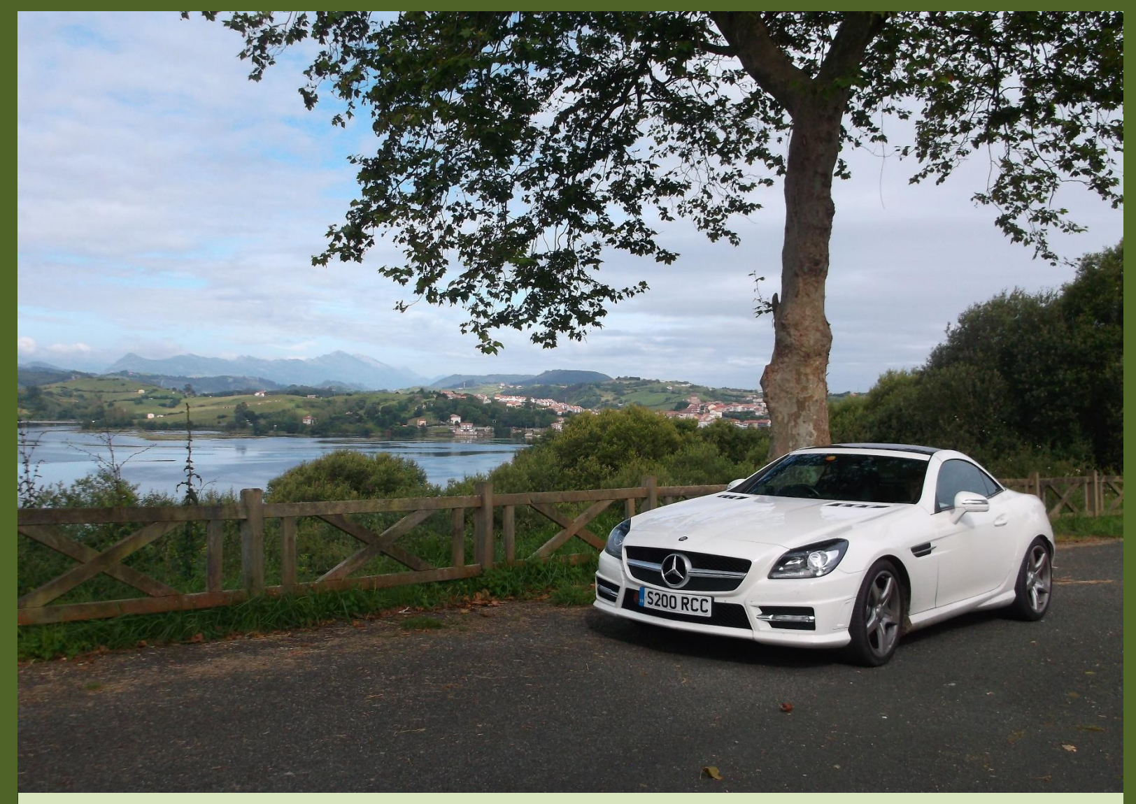
Back to Santander. With the roof up!