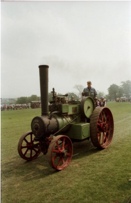
Spotted on Anglesey in 1984

on previous occasions we'd had a significant delay. This was in the time before sat nav was available so we had to rely on a map with Caroline following the route and directing me.