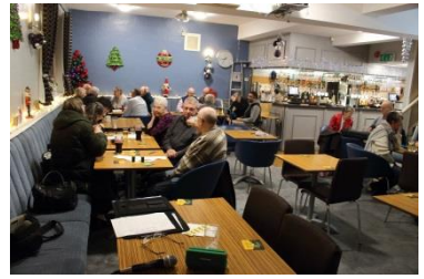
The teams deep in concentration