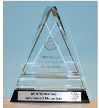
The MYAM trophy