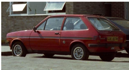
My first Fiesta

There can't be many drivers who haven't owned or driven a Ford Fiesta since its introduction in 1976. Now Ford have announced that they are stopping production of the car in 2023 after 47 years with over 22 million cars being sold. It was the smallest car that Ford had built at the time and their first with a transverse engine and front wheel drive. There have been seven generations of the car and I have owned two Mark 1 Fiestas one of which was one of the last of the Mark 1 XR2s to be built.