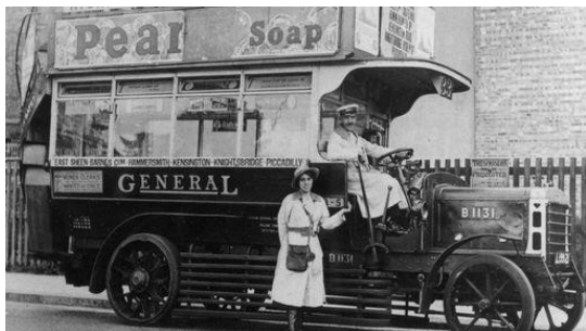
An early London bus dating from 1911