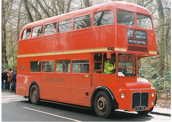
The bus they didn't want - now preserved

A fourth prototype was built as a coach version with fewer seats and intended to be used on Greenline express routes entering service in 1957. With the decline of Greenline travel in the late 60s it was demoted to ordinary bus duties and finally withdrawn from service in 1979. It was later bought by a preservation society and has now been restored to its original condition.