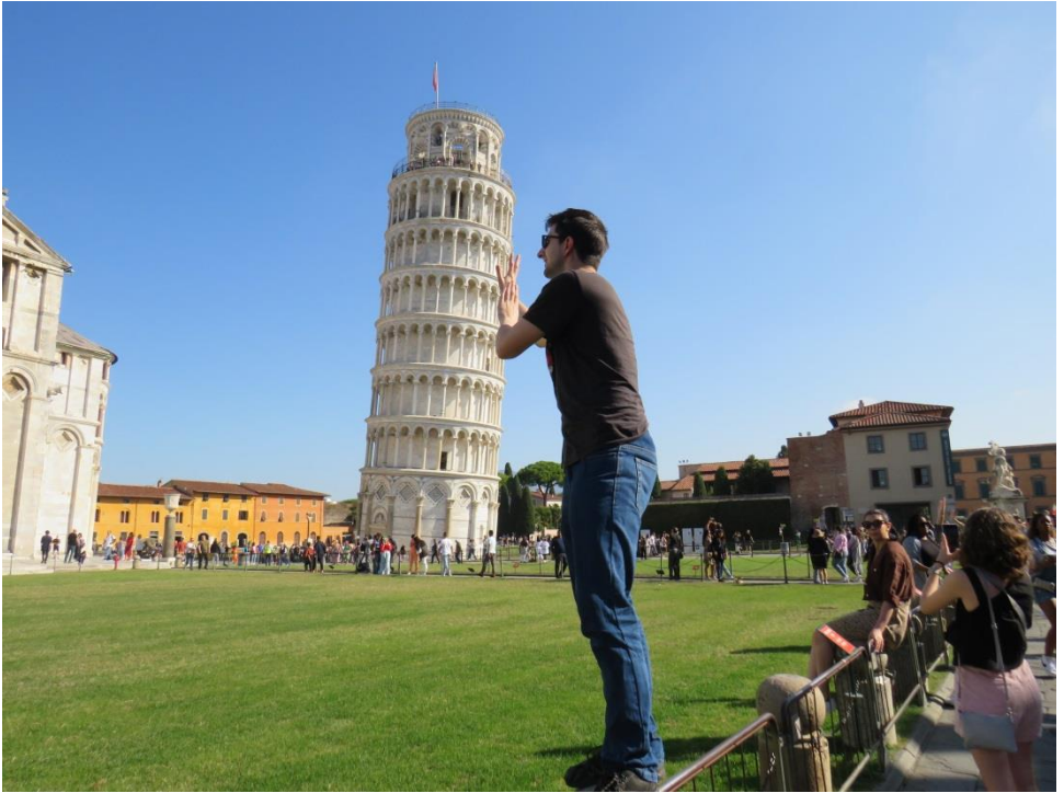
Well I guess he had to do what thousands of tourists in Pisa have done!