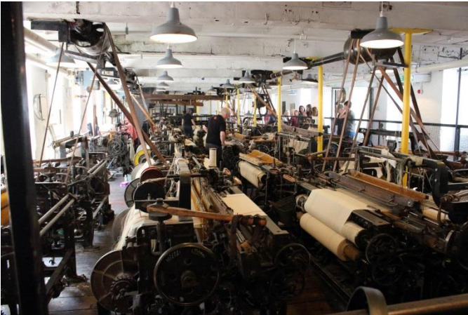
Inside Quarry Bank Museum