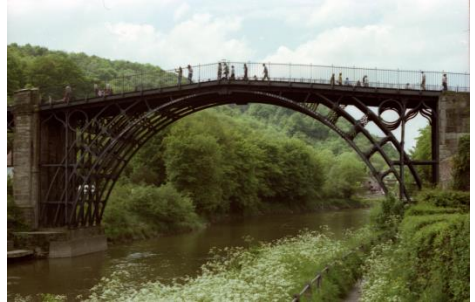
Ironbridge across the River Severn

Many of the early bridges were built of wood or stone depending on what was available locally but in the late 18th century a significant bridge was built across the river Severn at Ironbridge using iron.